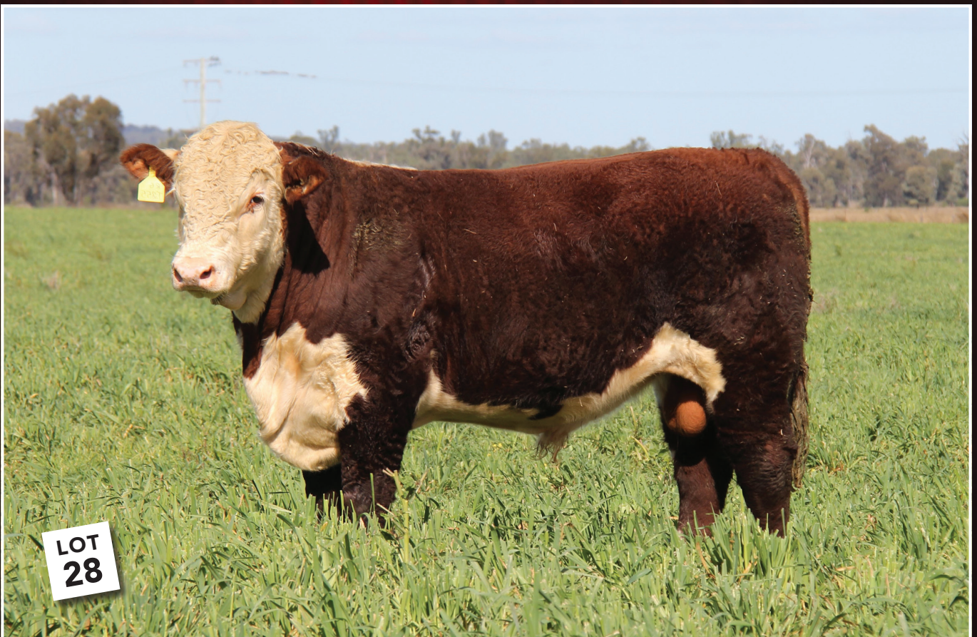
LOT 28 TALBALBA KINGSWOOD T255 (PP) AT 19 MONTHS. FULL BROTHER TO LAST YEARS TOP SELLER PICTURED ABOVE