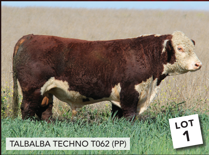
TALBALBA TECHNO T062 (PP)