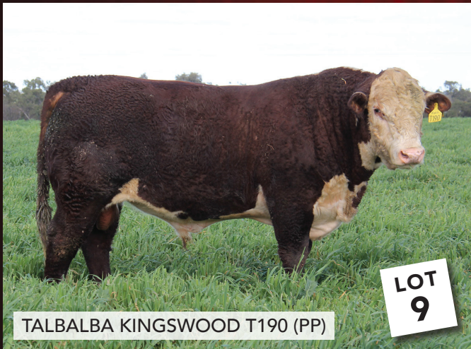
TALBALBA KINGSWOOD T190 (PP)