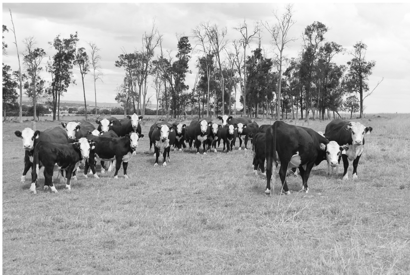
Heifers calved at 22-24 months PTIC.