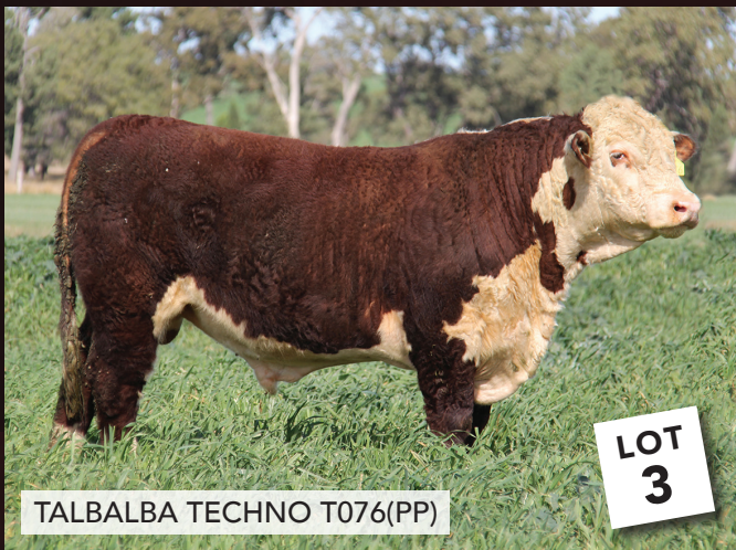
TALBALBA TECHNO T076(PP)