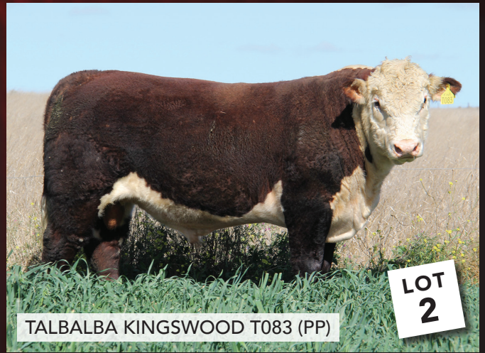
TALBALBA KINGSWOOD T083 (PP)