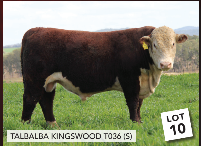
TALBALBA KINGSWOOD T036 (S)