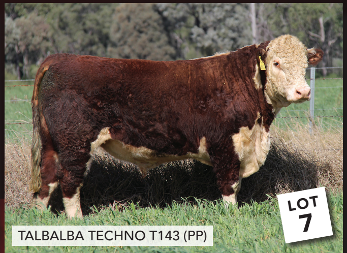
TALBALBA TECHNO T143 (PP)