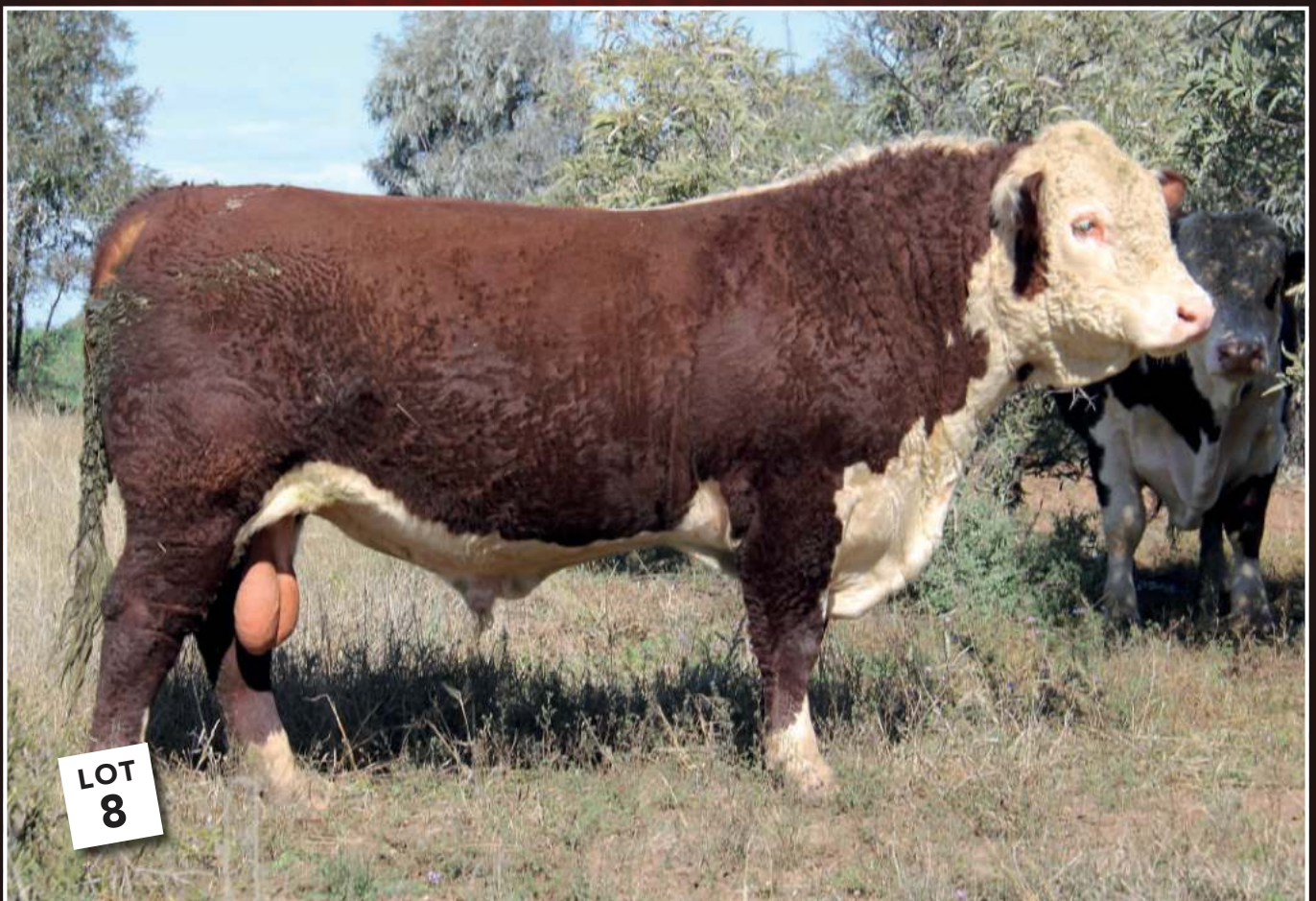
Talbalba Conrad Q086 (AI) (PP)