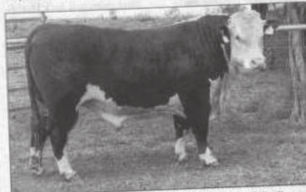
BEEF MACHINE: The top priced $100,000 bull Talbalba Emperor PO43.