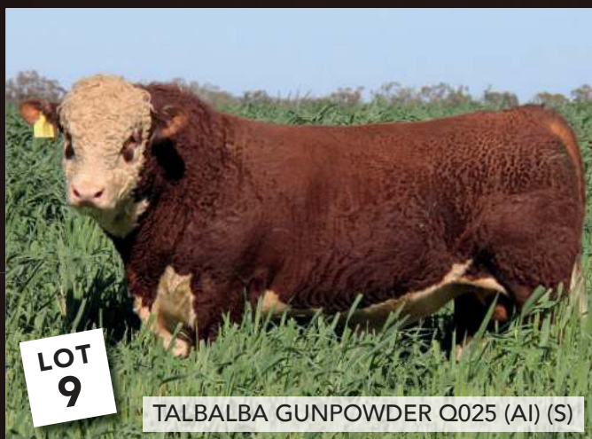
TALBALBA GUNPOWDER Q025 (AI) (S)