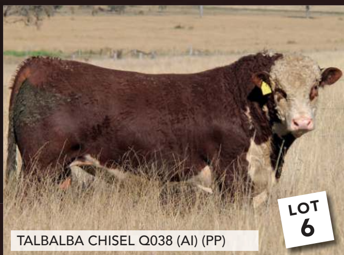
TALBALBA CHISEL Q038 (AI) (PP)