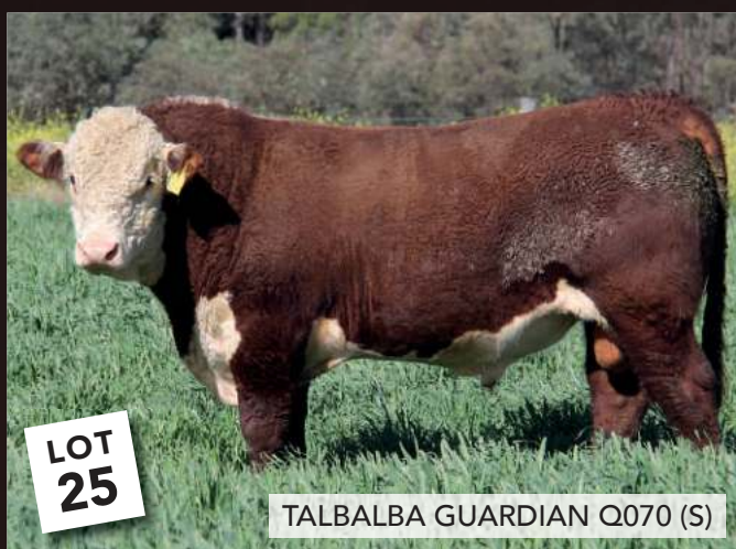
TALBALBA GUARDIAN Q070 (S)