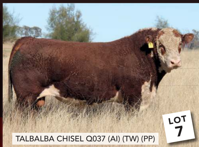
TALBALBA CHISEL Q037 (AI) (TW) (PP)