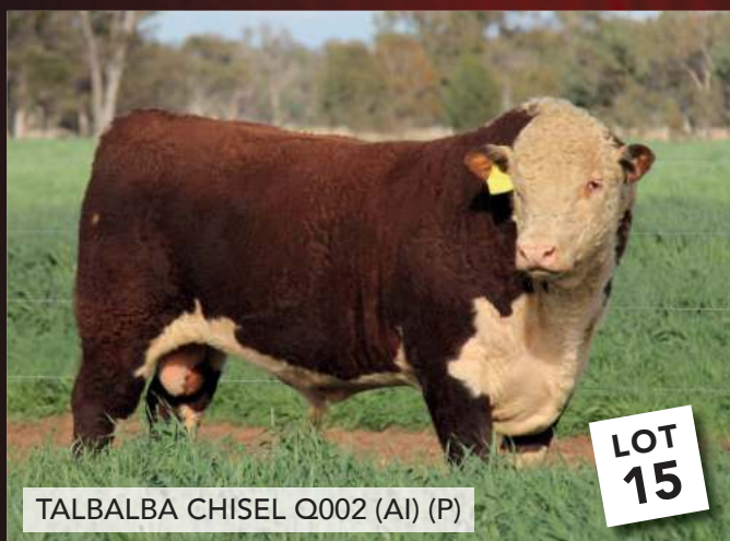
TALBALBA CHISEL Q002 (AI) (P)