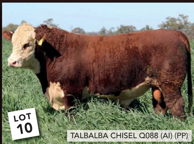
TALBALBA CHISEL Q088 (AI) (PP)