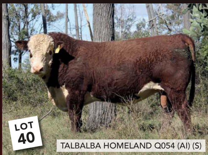
TALBALBA HOMELAND Q054 (AI) (S)

VIDEOS OF SALE BULLS CAN BE VIEWED VIA OUR WEBSITE