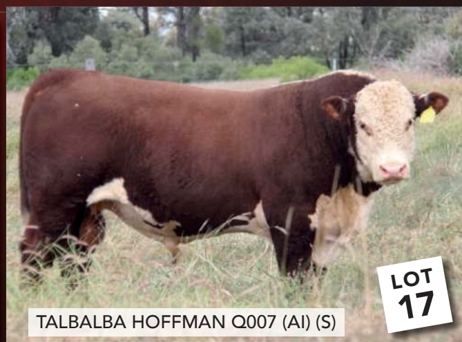
TALBALBA HOFFMAN Q007 (AI) (S)